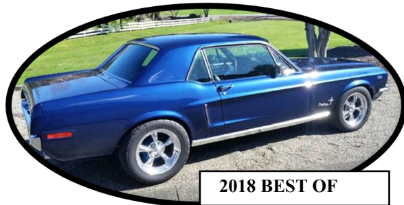
2018 BEST OF

Located at downtown Port Angeles' Gateway Transportation Center. Abundant parking, nearby shopping, restaurants, and many other shops.